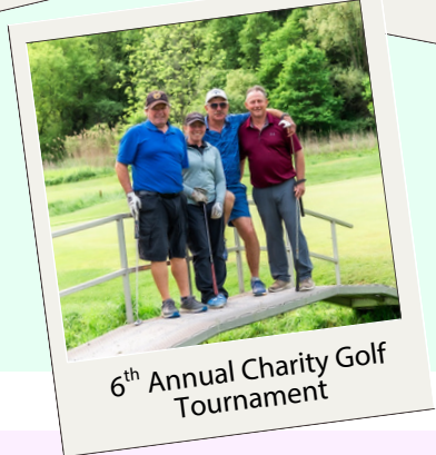
6 th Annual Charity Golf Tournament