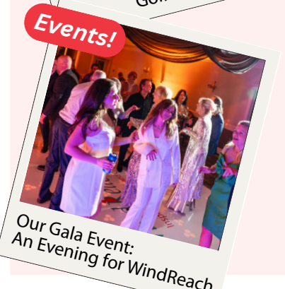
Our Gala Event: An Evening for WindReach