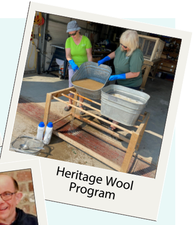
Heritage Wool Program