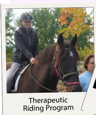
Therapeutic Riding Program

GET INVOLVED IN 2026! Visit the Farm Take a Tour at the Royal 2025 Gala Event Highlights