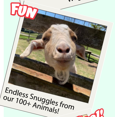
Endless Snuggles from our 100+ Animals!