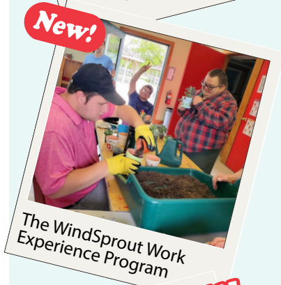
The WindSprout Work Experience Program