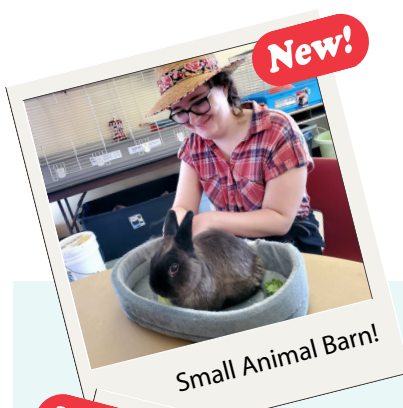
Small Animal Barn!

2025 was our 36th year of providing impactful programming, services, and 105 acres of outdoor space for people of all abilities! We couldn't do it without you! The gifts, time, skills, and efforts of many keep the Farm, programs, and services available to those who need us most. Your devotion to WindReach and all that we do is heartwarming. Read on to learn how your dollars and support impact and improve so many lives.