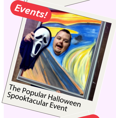
The Popular Halloween Spooktacular Event