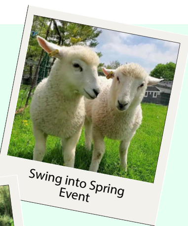
Swing into Spring Event