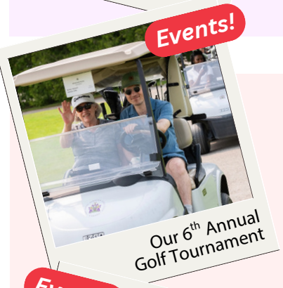
Our 6 th Annual Golf Tournament