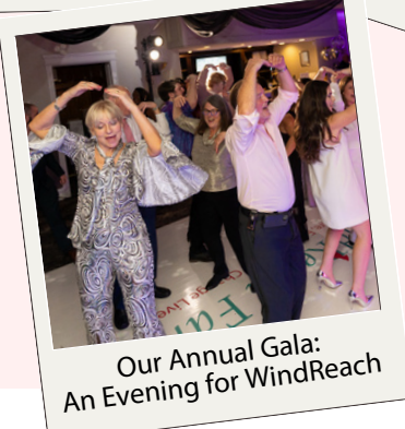
Our Annual Gala: An Evening for WindReach