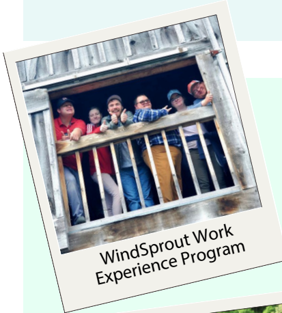
WindSprout Work Experience Program

GET INVOLVED IN 2026! All About WindSprout Attend Swing into Spring 2025 Golf Event Highlights