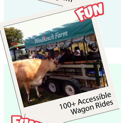
100+ Accessible Wagon Rides