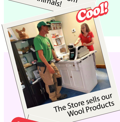
The Store sells our Wool Products