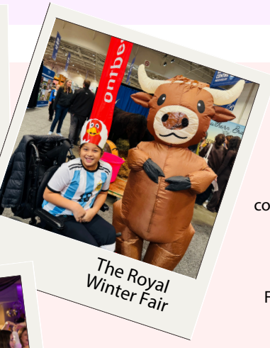
The Royal Winter Fair